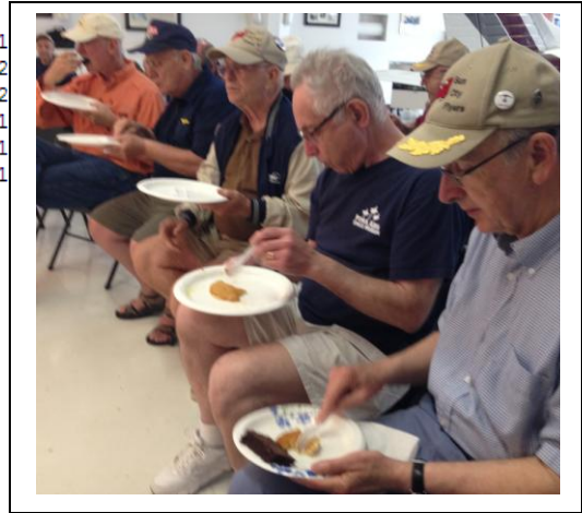
Pancakes hot off of our new turntable griddle were served at May's meeting. See the story below.